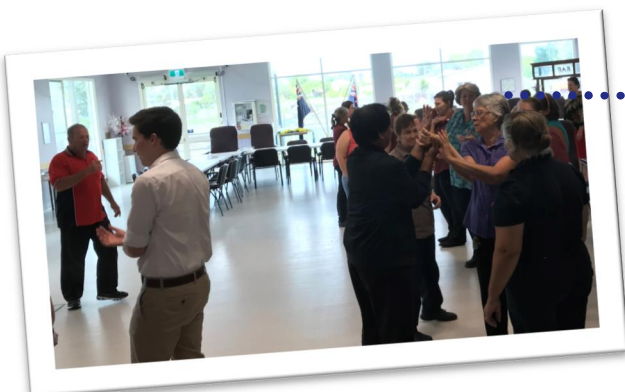
The first of two recent staff training sessions on dealing with aggression