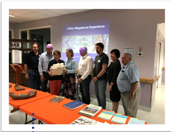
We also hosted the Information Evening for the Clifton Megafauna Group